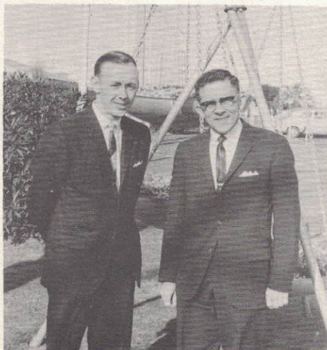
Prior to departure for Perth