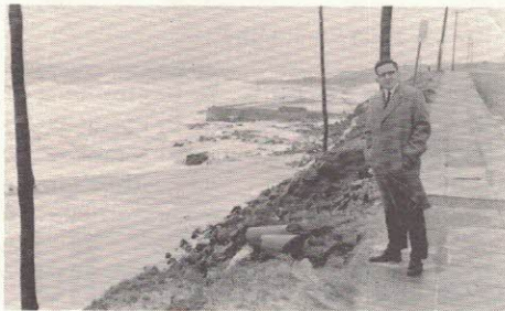
Sea-front at Bunbury

It was thought at the time that it may be necessary to hire a heated swimming pool for the baptising , because of the low temperatures. However, when the