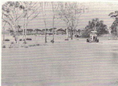
Flood-waters encountered enroute to Southern Cross

By the end of the 11-day country circuit, out of a total of 65 people (including those in Perth) who were scheduled