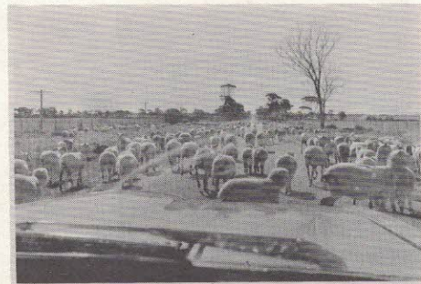
Flock of sheep enroute to Southern Cross

It is not so important to be serious as it is to be serious about the important things. The monkey wears an expression of seriousness which would do credit to any scholar, but the monkey is serious because he itches.